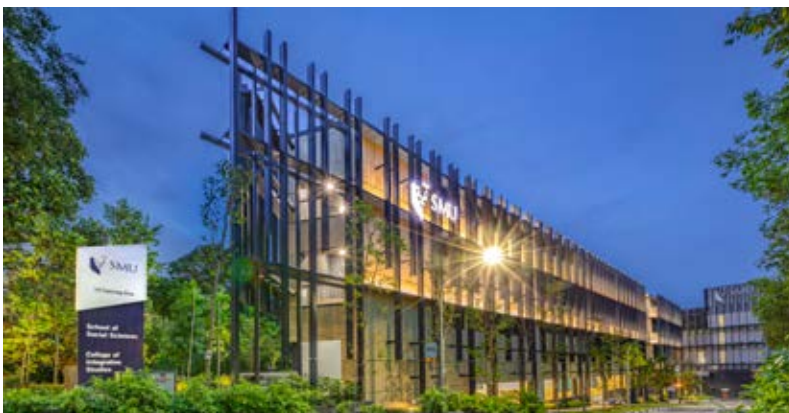
SMU College of Integrative Studies and School of Social Sciences building.

SMU is proud to be a key partner in MINDEF's broader efforts to develop future-ready digital talent for Singapore's defence ecosystem.