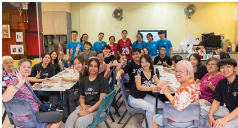
SMU's newest students gave back through Project Art2Heart II, one of several community service projects at this year's Freshmen Orientation.