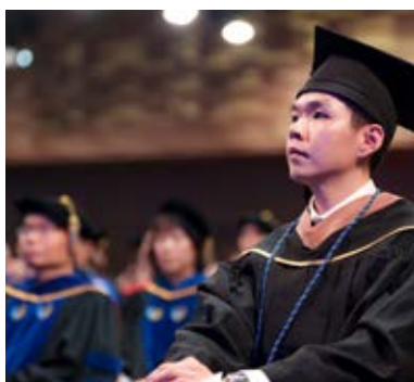
At Commencement 2025, the CCT cord made its debut, honouring students' growth not just in academics, but in leadership, community engagement, and readiness for the world ahead.

More than 60 per cent secured employment before graduation, demonstrating the strong market confidence in SMU's talent pipeline and the University's emphasis on experiential learning and industry-aligned education.