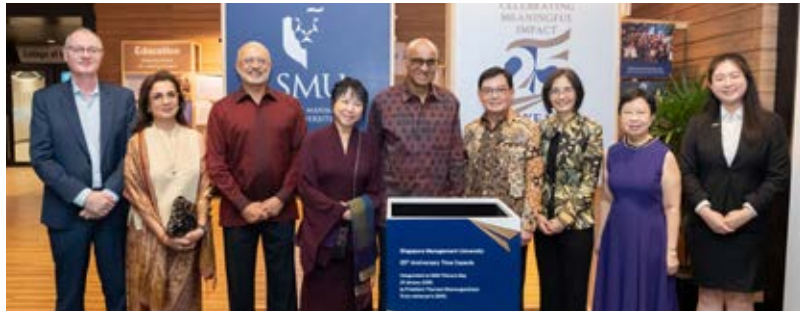
SMU Patron's Day 2025.

Besides the party, there was the largest-ever gathering of SMU Makers, a vibrant assembly of