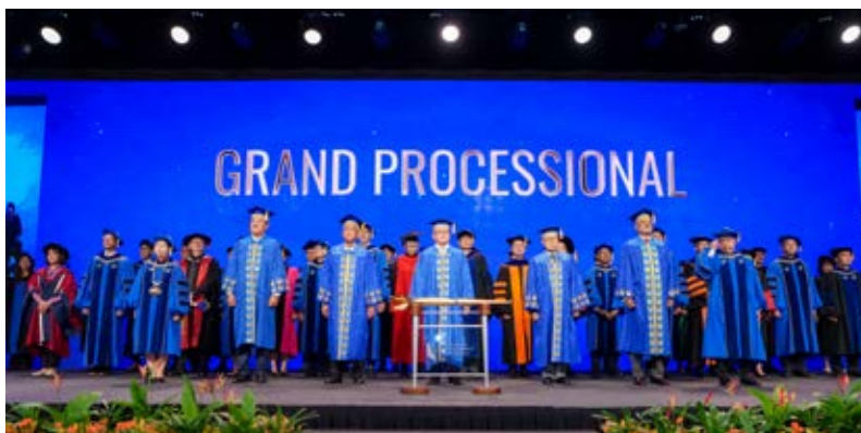
The Opening Ceremony at SMU Commencement 2025.

These graduates join the over 40,000 alumni who are now leaders and changemakers across business, government, social impact, and the arts.