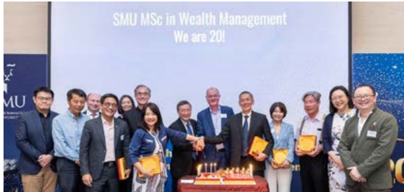
SMU celebrated the 20 th anniversary of its Master of Science in Wealth Management (MWM) programme with a gala dinner and awards ceremony on 18 October 2024, attended by nearly 200 alumni, members of the MWM Advisory Board, faculty, university and corporate partners.

In a world driven by rapid digital transformation, staying competitive demands active immersion in innovation. SMU is stepping forward to help mid-career professionals meet the shifting demands of a digital-first economy. These programmes, under the Academy's Internationalisation Series, will provide participants with the knowledge and skills needed to excel in an increasingly competitive global environment.