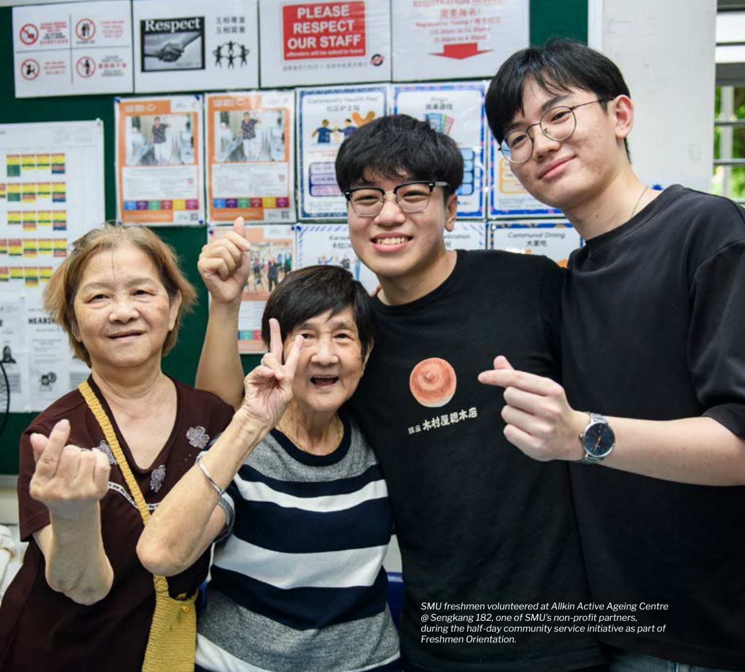
SMU freshmen volunteered at Allkin Active Ageing Centre @ Sengkang 182, one of SMU's non-profit partners, during the half-day community service initiative as part of Freshmen Orientation.

This same drive to prepare graduates for the future also fuels our research, where ideas are turned into solutions that shape industries, communities, and policy.