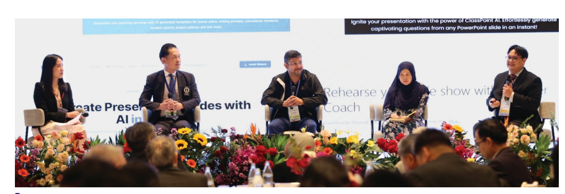
Panellists at the 4th AUN-TEPL Symposium organised by SMU in Bangkok

Senior leaders and educators from the ASEAN University Network (AUN) gathered in Bangkok for the 4<sup>th</sup> AUN-TEPL [Technology-enhanced Personalised Learning] Symposium on 28 May 2024. Organised by SMU in collaboration with other universities in the region, the event focused on "AI for Personalised Learning".