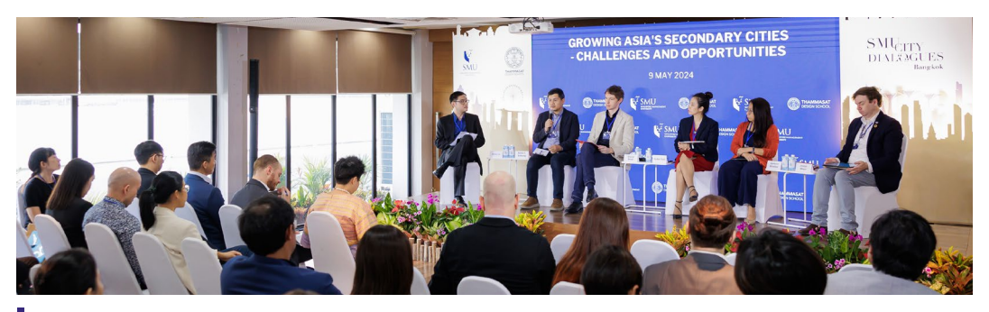
SMU City Dialogues Bangkok 2024.

SMU launched the inaugural overseas edition of City Dialogues in Bangkok on 9 May 2024. Held in partnership with Thammasat University, the event focused on the theme "Growing Asia's Secondary Cities – Challenges & Opportunities". The forum gathered leaders from various sectors to discuss sustainable urban development.