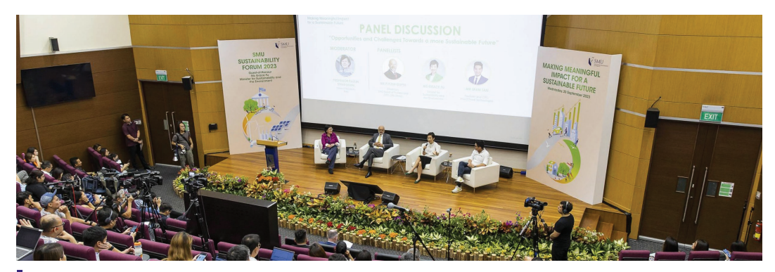
SMU Sustainability Forum 2023

In 2023, the inaugural SMU Sustainability Forum attracted 250 participants, including students, educators, and industry leaders. The event was attended by Minister for Sustainability and the Environment Ms Grace Fu; and included a keynote address